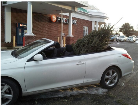
Left: How to load a Christmas Tree into a convertible.