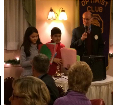
Bring a friend to our next meeting, January 8, 2014!

December Board Meeting Cancelled Due to the fact that three Board members were scheduled to work the tree lot and that there were no pressing topics to consider, the December Board meeting was cancelled. Any necessary business would be done by email.