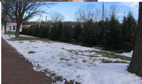
Right: Now you don't! The lot sold out more than a week before Christmas!