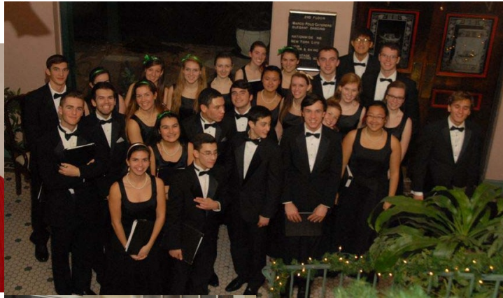
Left: The Madison HS Madrigals performed seasonal music at our annual Holiday Party on December 18.